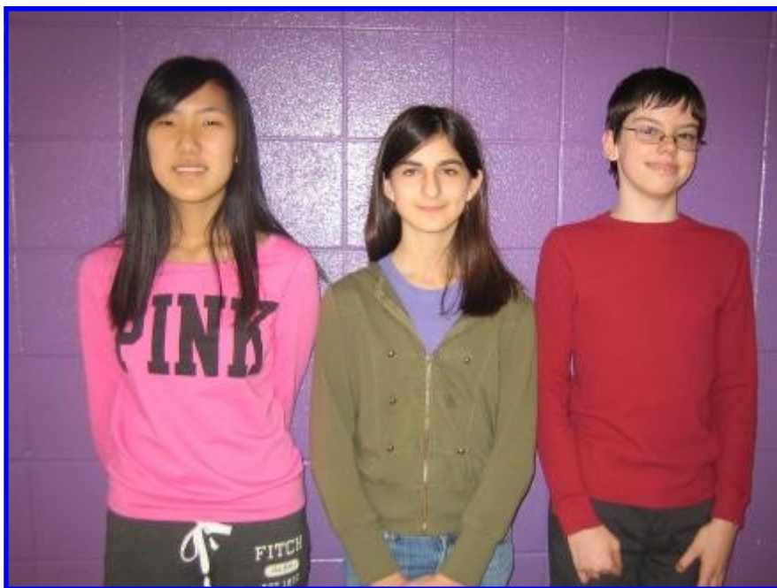
Students with perfect ACT Explore scores from Larson (from left to right):